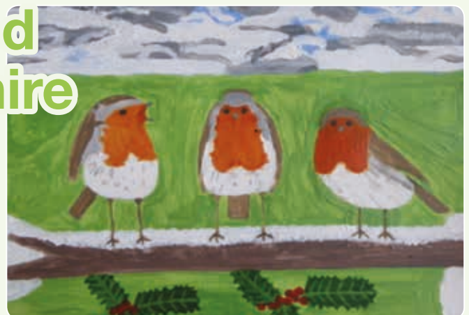
Robins around snow with holly leaves and berries: Acrylic

I really enjoy walking and working in the countryside and appreciate the outdoors which provides me with inspiration for my paintings, and my abstract mind and sense of humour gives my paintings quirkiness and uniqueness.